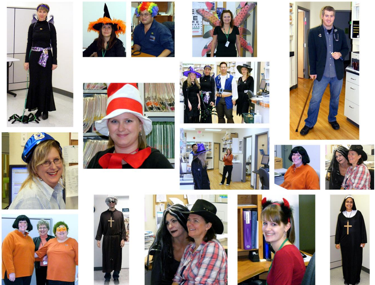
Halloween at the Centre (2008)

Visit www.colorectal-cancer.ca for more information.